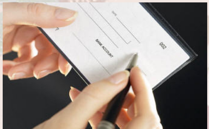
Good cashflow is essential for a profitable business. Check out our handy guidelines to improve yours.

Also, talk to us! We can help you - as our back page article on City Bathrooms and Kitchens illustrates. We would be happy to talk through any issues with you.