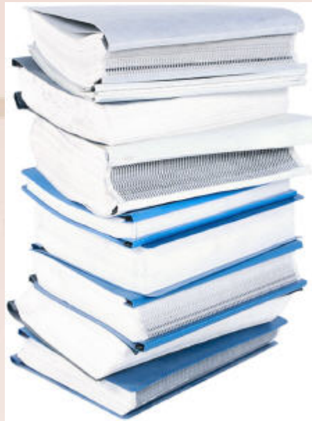
Companies should face less bureaucracy with reforms of the Companies Act.

end. As mentioned in a previous newsletter we will be writing to you with details of the month allocated for production of your accounts. We are hoping to be in a position to notify you shortly after one of our busiest periods, the tax return filing deadline at the end of January!